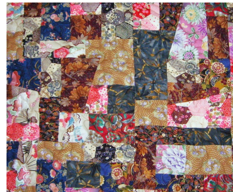
'Crazy Quilting Pieces'