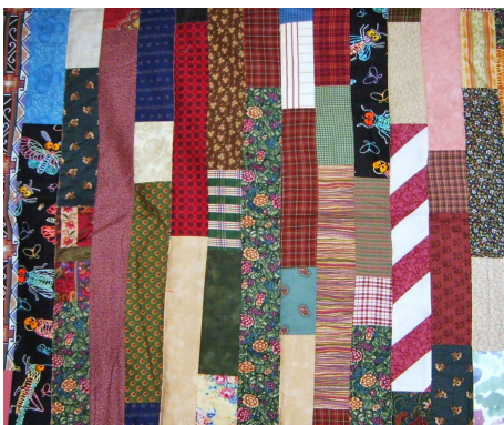
'Long Strips Joined'