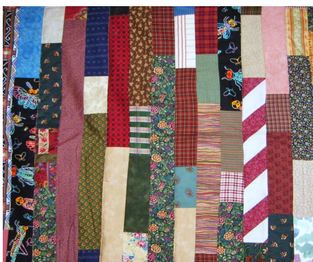
'Long Strips Joined'