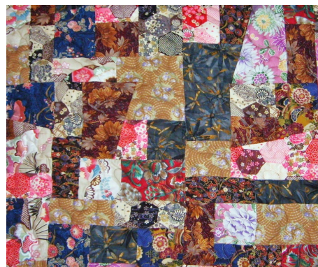
'Crazy Quilting Pieces'